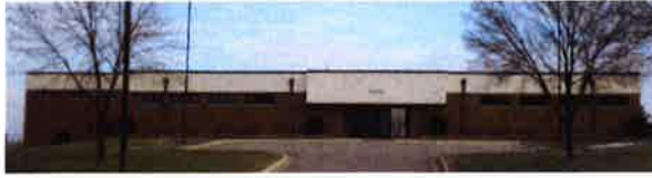
Maple Grove Water Treatment Plant