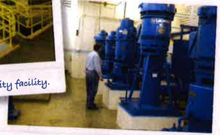
Water pumps providing Maple Grove's clean water.