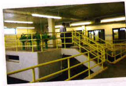
Control panel at Maple Grove utility facility.