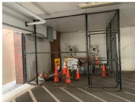
Existing ground level parking area storage enclosure will be demolished and replaced with an enlarged and enclosed space.

The image below shows the current ramp storage space in the northwest corner. The proposed storage room would be a sealed space with walls and a secured door. It would include some lighting and a space heater.