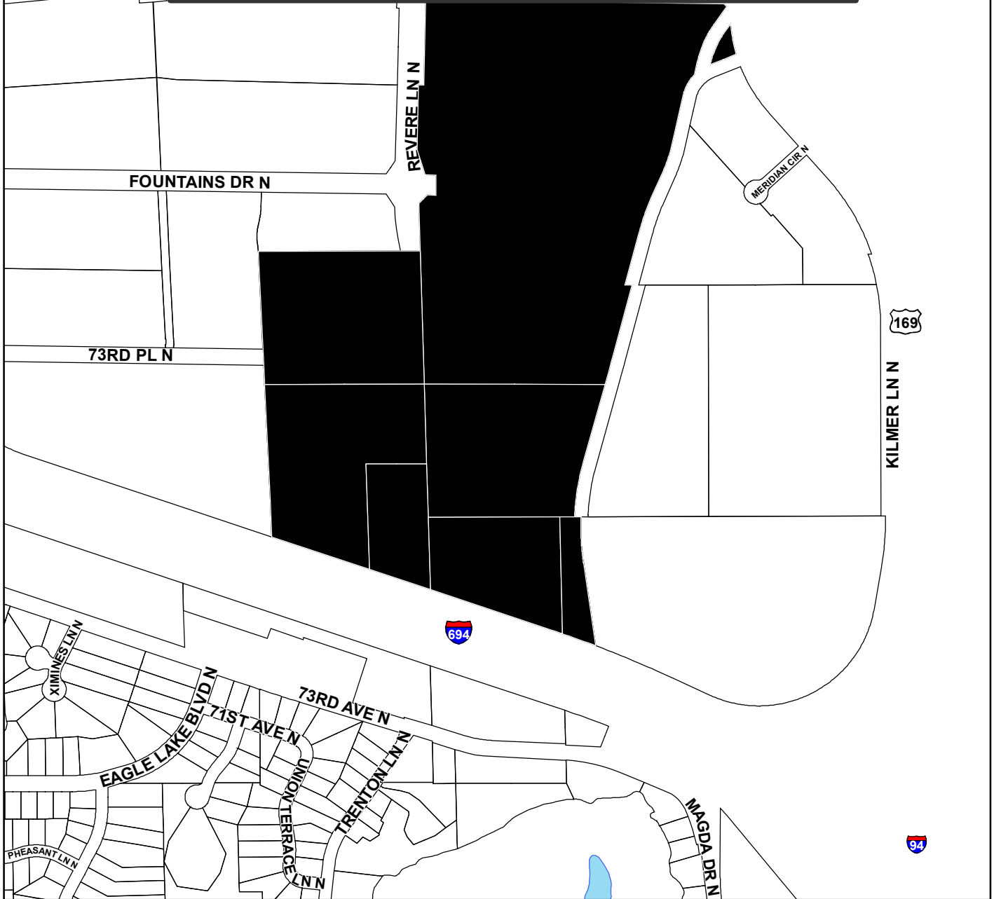
NEIGHBORHOOD LOCATION MAP